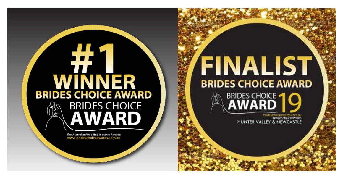
Hunter Valley & Newcastle Brídes Choice Awards 2018 Winner: Wedding Venue - Licenced Club 2019 Finalist: Wedding Venue - Licenced Club

If you are having an intimate wedding with less than 50 guests or you would prefer to have the freedom to use your own suppliers, to add your own creative flair to your special day and to design your wedding tailored to your individual requirements and budget this option allows you to do so. For more information on how to design your own package please see page 12