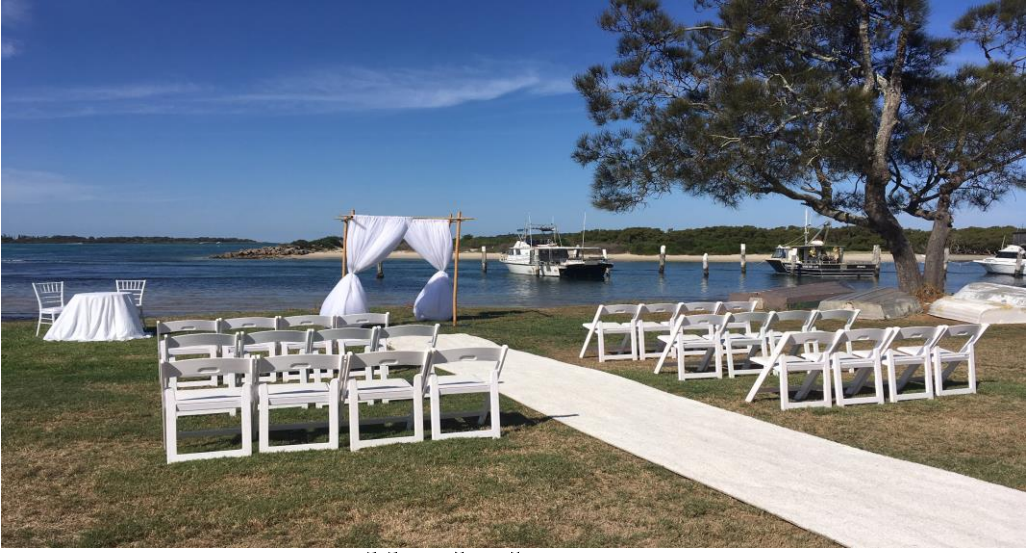
Eddie Charlton Reserve

The above locations are just suggestions. You are more than welcome to select an alternate location in the area.