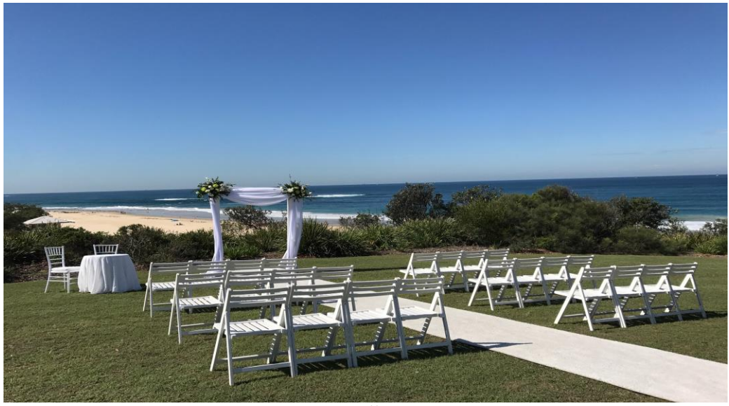
Caves Beach - Area B